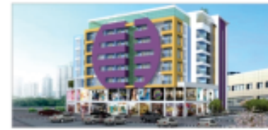
SMART CITY Thokkottu, Mangalore.