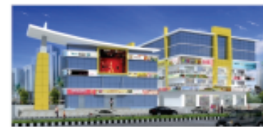
SAHAKARI MALL Near Rao & Rao Circle, Mangalore.