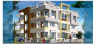
ROYAL RESIDENCY - B Deralakatte, Mangalore.