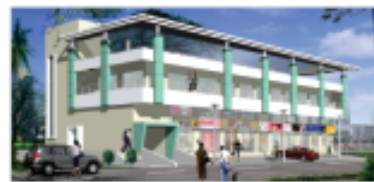
ROYAL TOWER Bibi Alabi Road, Mangalore.