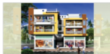
MAX CITY Near Central Market, Mangalore.