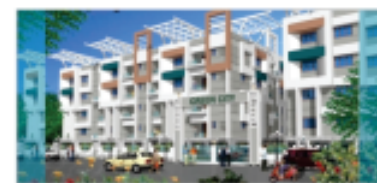
GREEN CITY Thokkottu, Mangalore.