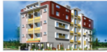
ROYAL RESIDENCY - A Deralakatte, Mangalore.