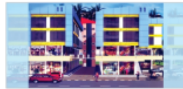
CITY PLAZA Kalladka.