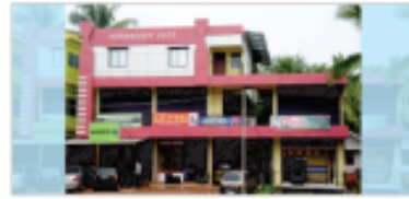
HOSANGADY GATE Hosangady, Manjeshwar.