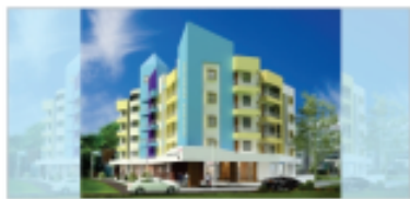
SMART PLANET Thokkottu, Mangalore.