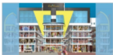
CITY CENTRE Uppala, Kasargod.