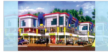
UNITY TOWER Neeleshwara, Kasargod.