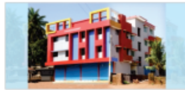
THOUHEED RESIDENCY Kunjathur, Manjeshwar.