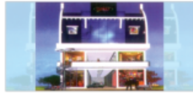
SMART TOWER - B Kushalnagar, Coorg Dist.