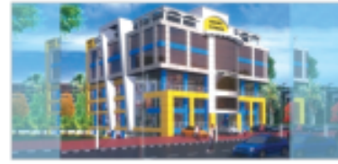
SMART TOWER - A Jyothi, Mangalore.