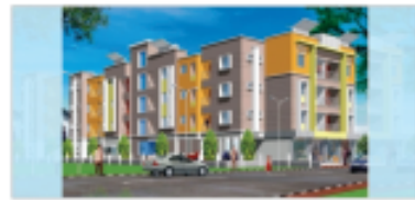
ROYAL EMBASSY Kasargod.